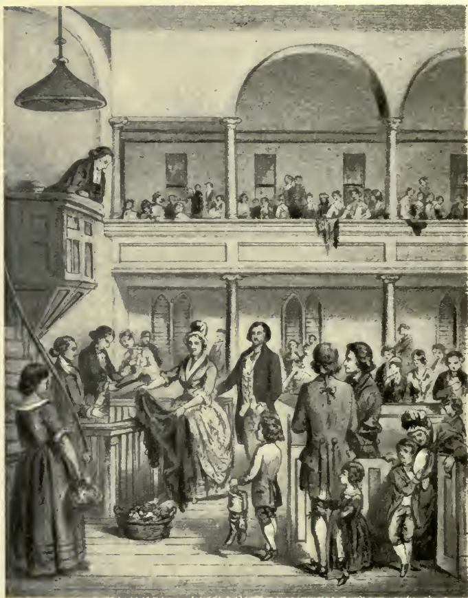
Madam Faith Trumbull contributing her scarlet cloak to the soldiers of the Revolution.